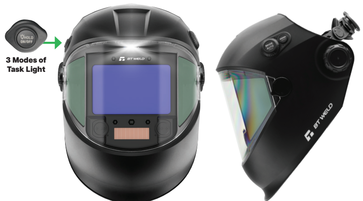
3 Modes of Task Light