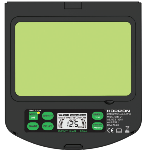
ADF (Automatic Darkening Filter) Controls