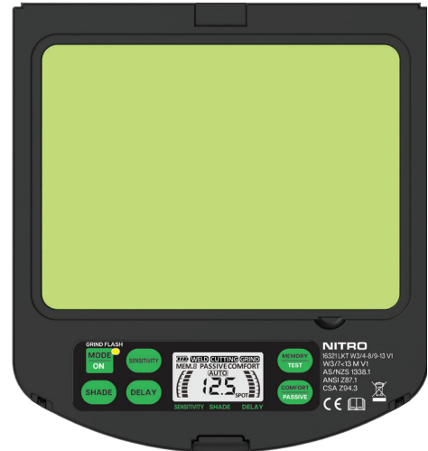
ADF (Automatic Darkening Filter) Controls